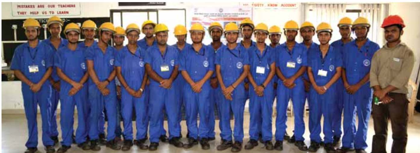
Skilled Development Training Programme for Backward Class Youths, Bilaspur (Chhattisgarh)

Furthermore, IRCON has implemented various CSR activities related to Health care through medical camps, provision of Health equipment, up gradation