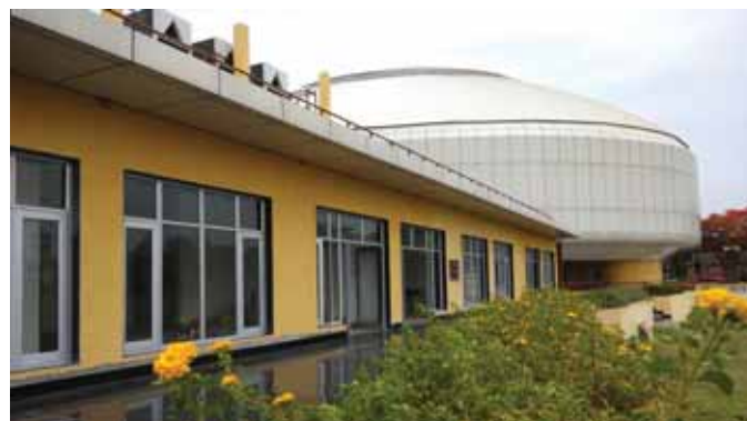
Indoor Sports Complex at Behala, Kolkata