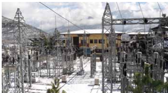
66 KV Substation at Paro, Bhutan

Engineering, Construction, Supply, Erection, Testing and Commissioning of New 2x20 MVA, 66/33 KV sub-station including all associated works at Paro in Bhutan by Bhutan Power Corporation Limited, at a value of Rs. 23 crore, has been completed in March 2017.