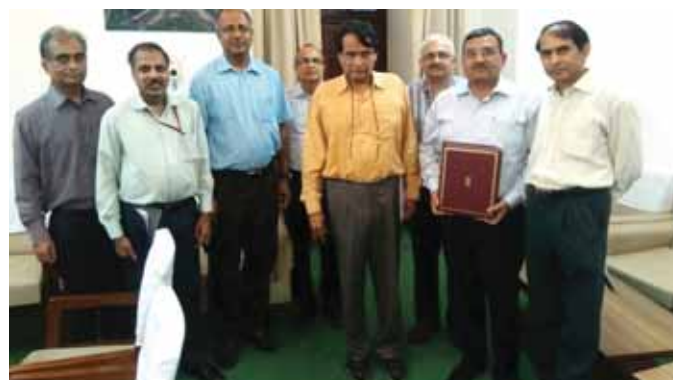
Signing of MOU with RLDA