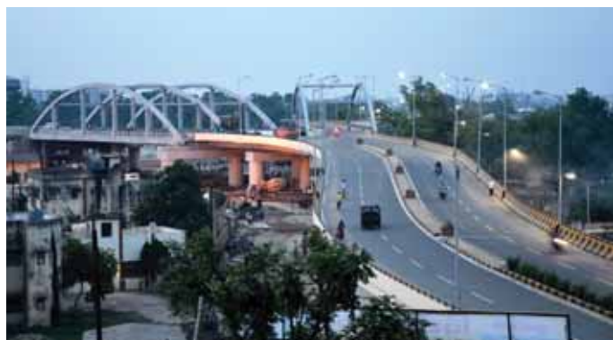
Danapur ROB Bihar