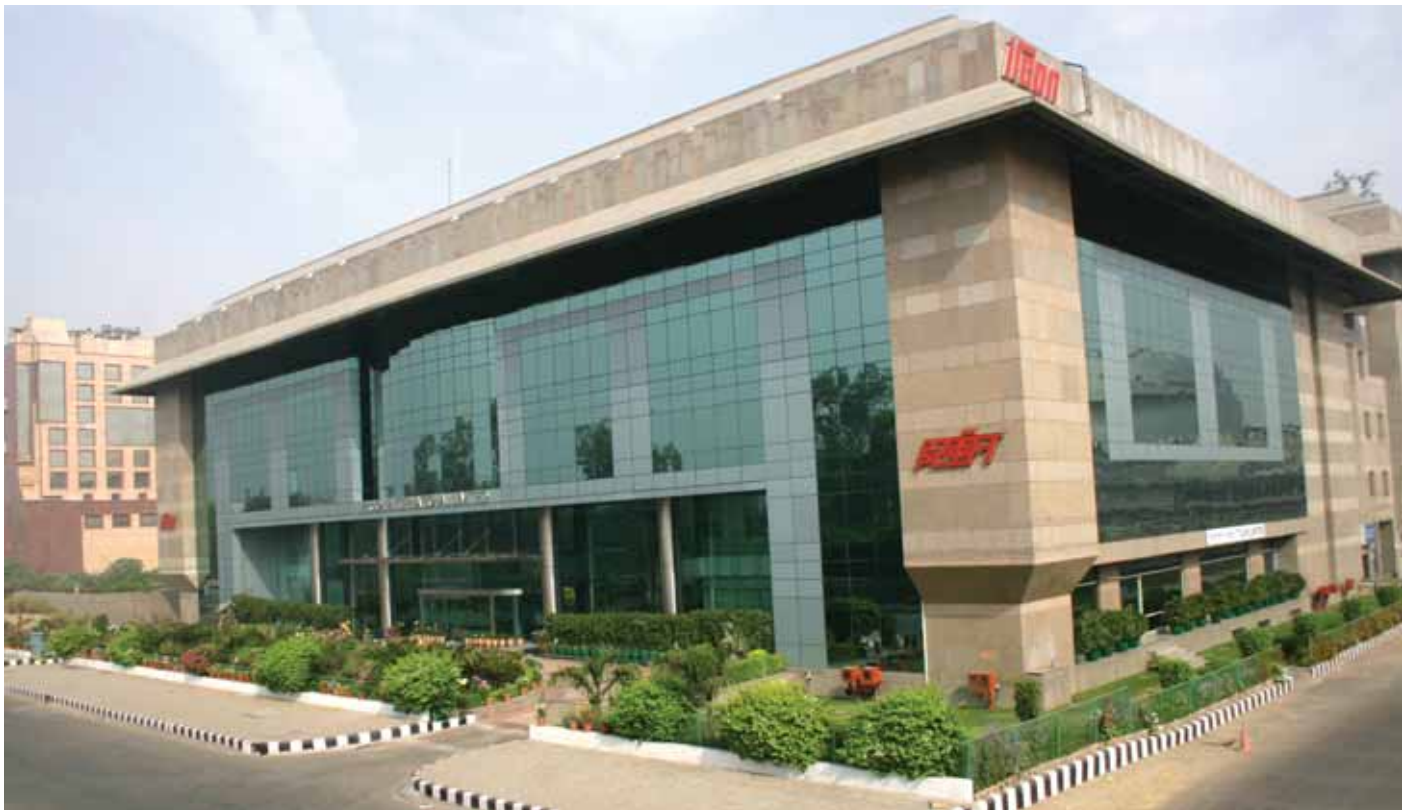
Corporate Office Building of Ircon at Saket, New Delhi

Indian Overseas Bank State Bank of India HDFC Bank