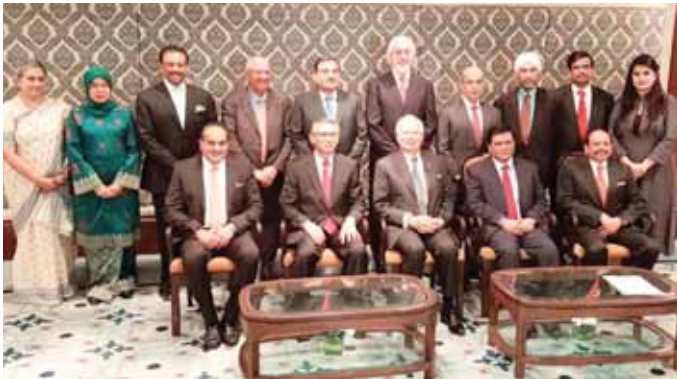
Meeting with the delegation headed by Hon'ble Najib Razak PM of Malaysia in New Delhi

Concerted efforts are being made to secure contracts in Malaysia, Bangladesh, Tanzania, Sri Lanka, and Iran.