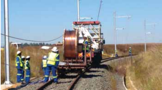
Railway Electrification work, South Africa

progress and likely to be completed by 31st March 2018.