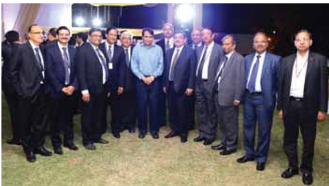
Interaction on Railway Cooperation Opportunities Function organised by Hon'ble Minister of Railways