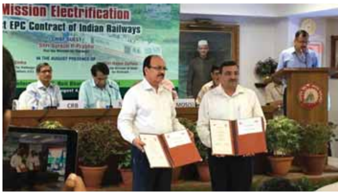
Signing of MOU