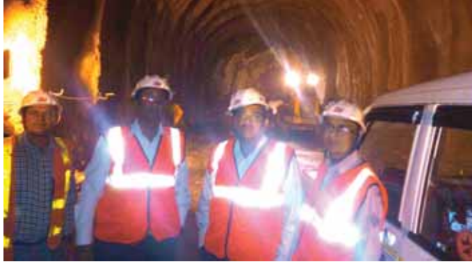
Inspection by CMD at Tunnel T49 USBRL, J&K Rail Link Project