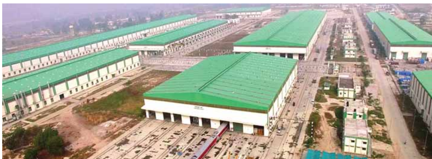
Bird eye view of Modern Coach Factory, Rae Bareli