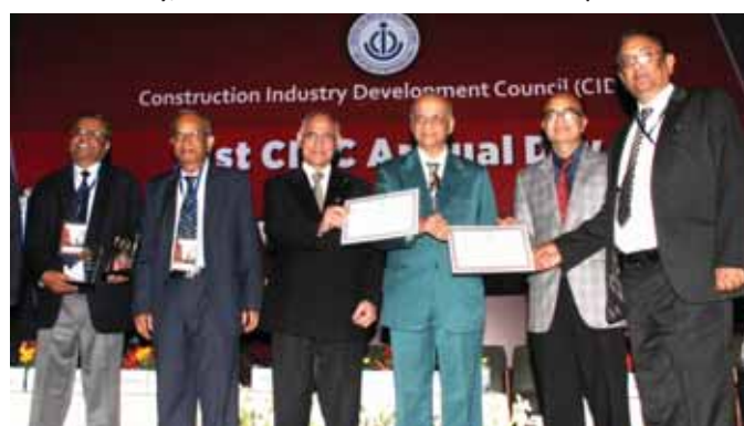
CIDC Vishwakarma Award 2017 for Best Construction Projects (Railways)