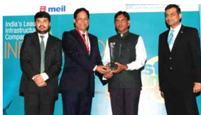
D&B Infra Awards 2016 in Construction & Infrastructure Development ( Railways)