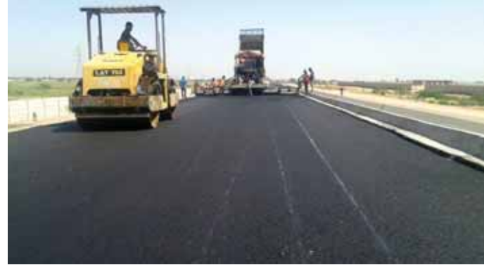
DBM Laying Bikaner - Phalodi Highway Project