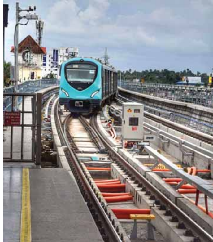
Ballastless Track Kochi Metro

In March 2017, following two projects at a total value of Rs. 178 crore got completed in India for Delhi Metro Rail Corporation Limited (DMRC):